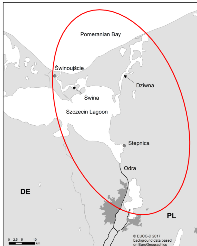
Fig. 2: Case study site Szczecin Shoreland, Poland

Location of study sites: The Szczecin Shoreland (the westernmost part of the Polish coast) occupies territories around the Szczecin Lagoon, the estuary of the Odra River and Pomeranian Bay shores. The study site Pomeranian Bay includes the Polish part of the bay, reaching from the city of Świnoujście to the lighthouse in Gąski. The Szczecin Lagoon is the most southern, coastal bay of the Baltic Sea. The Polish part covers about 410 km 2 and includes several lakes and lagoons as well as the straits Świna and Dziwna. The river Odra flows into the lagoon, so that the area becomes part of the extensive estuary system. The lagoon is connected with the Baltic Sea through the 3 straits. As a result of difficult water exchange with the sea, the water reservoir belongs to the brackish waters. The average salinity lies between 0.5 and 2 psu, nevertheless sometimes more salt water penetrates the Świna raising the salinity to 6 psu. Its natural average depth is 3.8 meters. The depth of shipping channels however can exceed 10.5 meters.